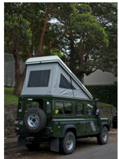
Pop Top Roof lifts in seconds

Two aluminium frames, in the colour of your vehicle, form a solid base for the roof. As we use the standard Defender roof we ensure that the conversion fits harmoniously into the overall design of your vehicle and the height only changes slightly to standard measurements.