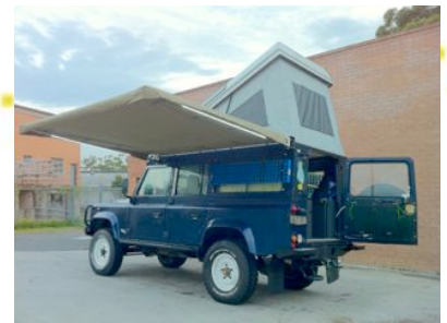
The Pop Top Roof converts your vehicle into the perfect off road camper.