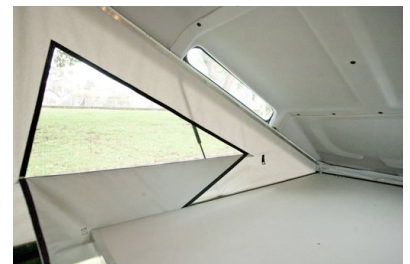
Windows on all sides for great airflow