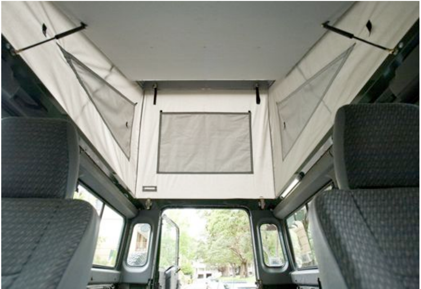
Pop Top Roof with the bedding platform lifted for full standing height during the day