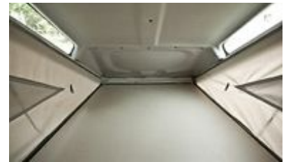
Comfortable sleeping area